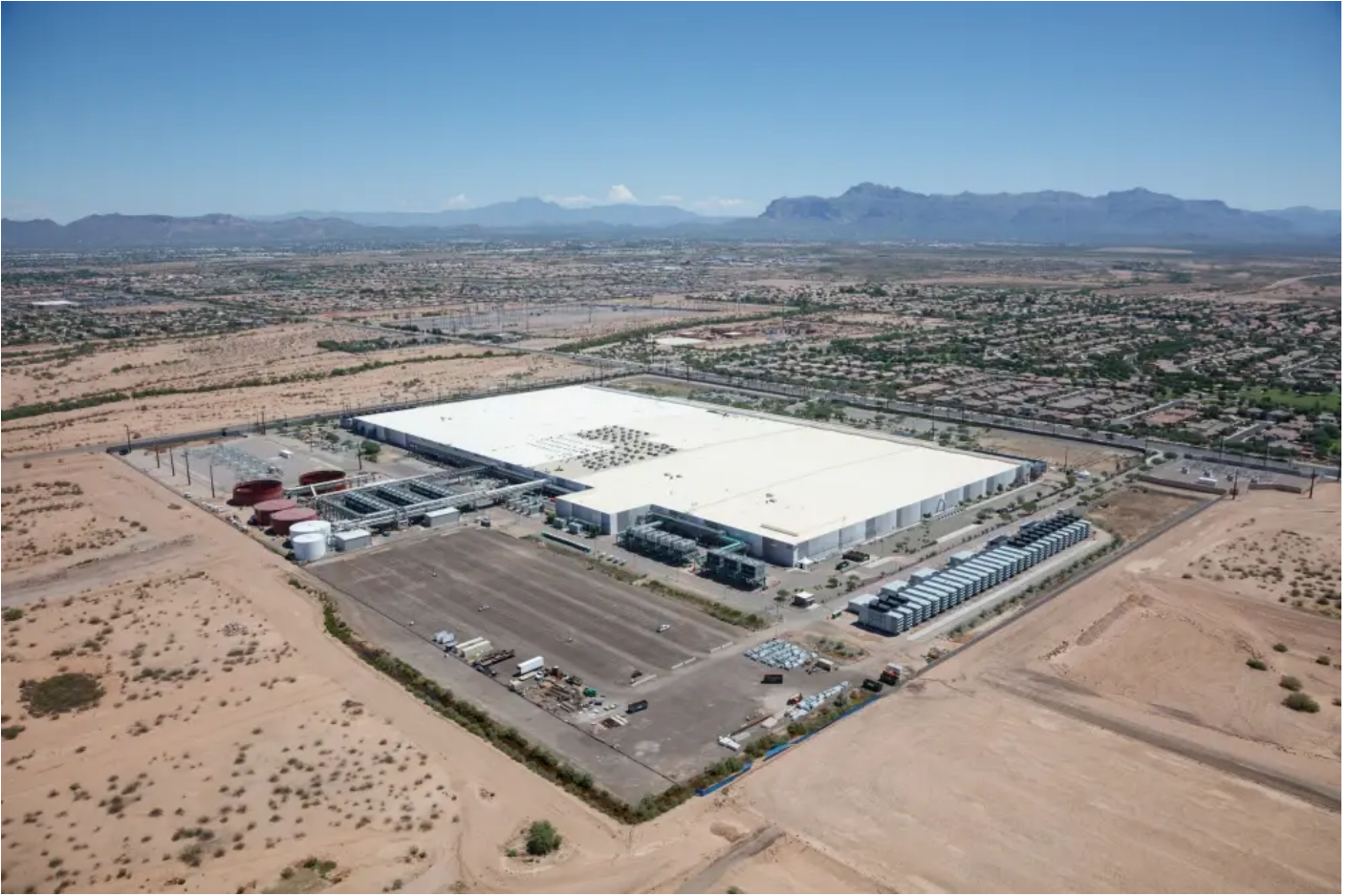
Image: Apple's data center in Mesa, Arizona

In 2021, the City Council of Mesa, Arizona approved the construction of a new hyperscale data center that would require 1.25 million gallons of water per day, exacerbating the concerns of Mesa residents growing increasingly frustrated by the exorbitant water use of hyperscale data centers in their already drought-stricken community.